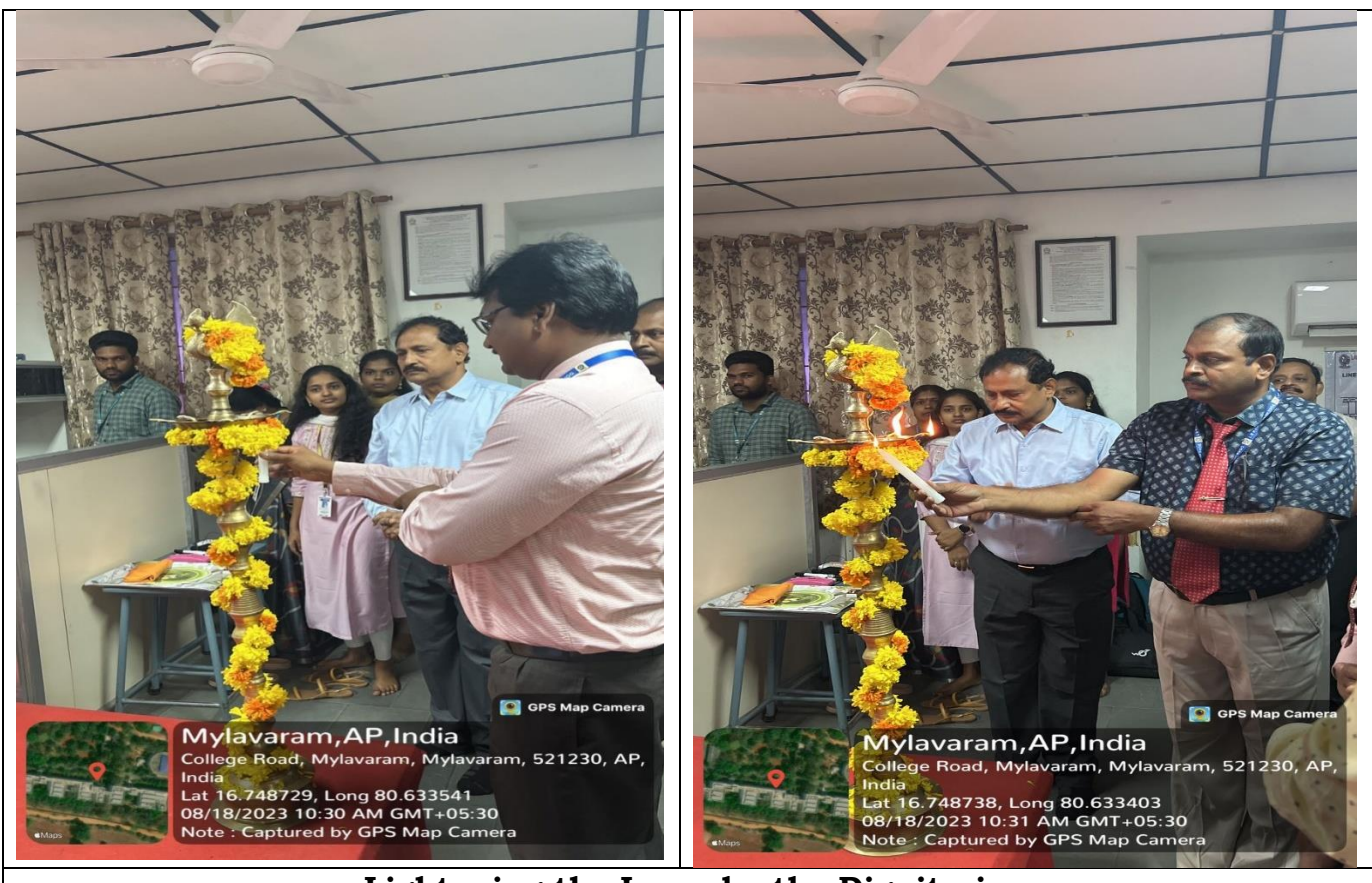
Lightening the Lamp by the Dignitaries